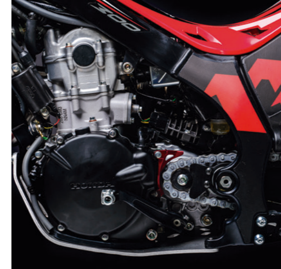
Highly reliable 4-stroke engine

The spectacular Montesa 300RR still stands out for its exclusive features and its racing style.