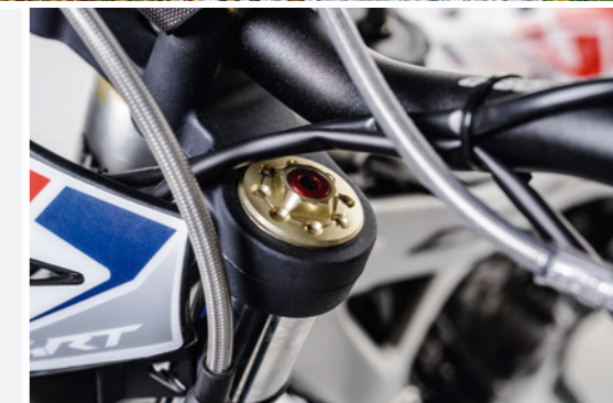
Anodised suspension caps