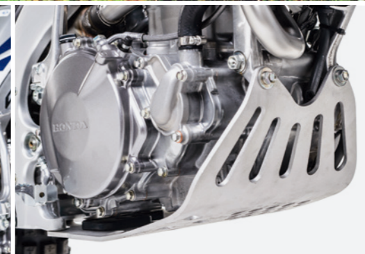
New more resistant crankcase guard