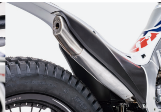
Aluminium and steel exhaust