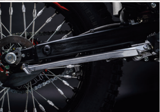
New side stand