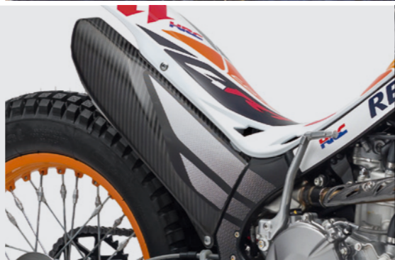
Carbon fibre silencer guard

NEW BRAKE MASTER CYLINDER with improved touch and resistance