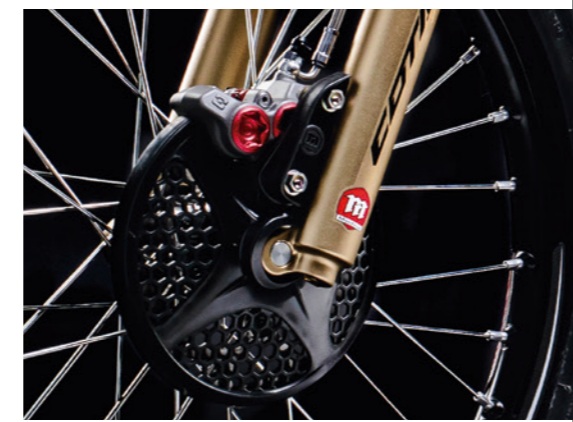
New brake callipers with more power