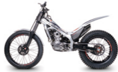
MONTESA COTA 4RT