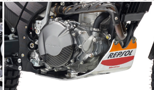
New more resistant crankcase guard and side engine cover