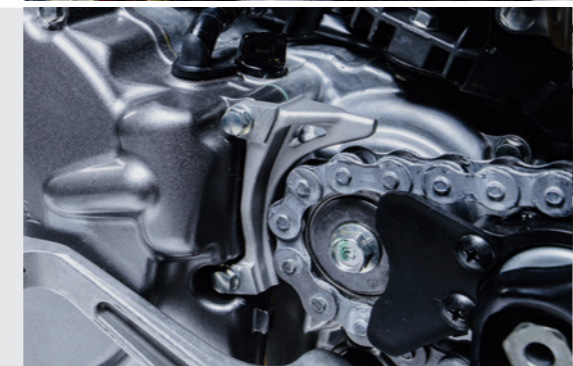
An engine protector is added