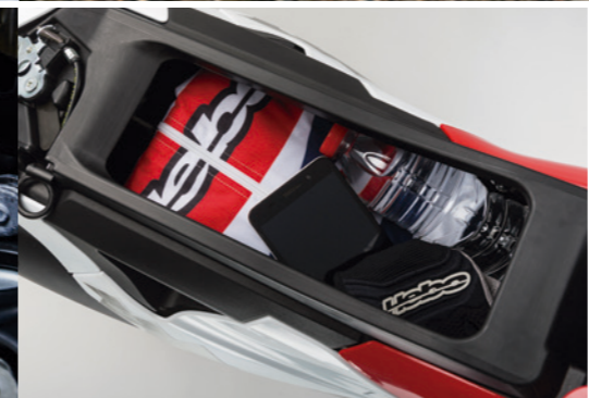
Practical storage space underneath the seat for a jacket, gloves or other objects