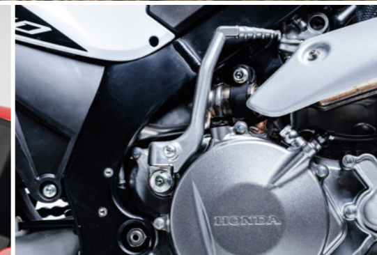
New shorter kick start for easier starts astride