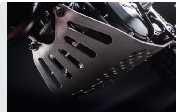
New more resistant skid plate guard