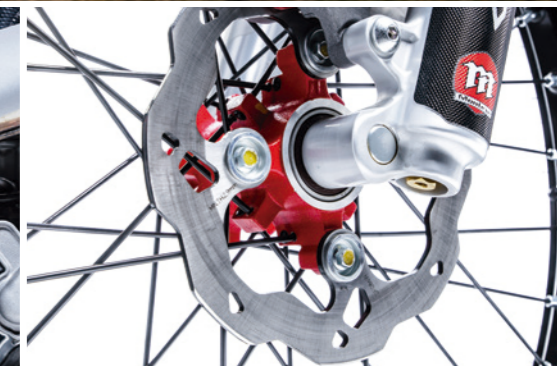
Wavy brake discs