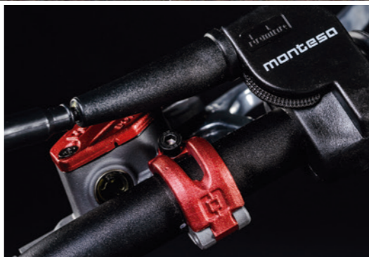
Improved durability and touch thanks to the new brake master cylinder