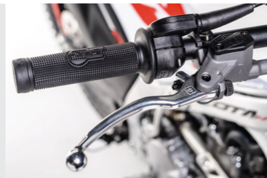
New brake master cylinder

NEW BRAKE MASTER CYLINDER with improved touch and resistance