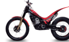
MONTESA COTA 300RR