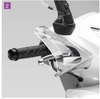
2 Knuckle Protector Set

Specially engineered for the Vision 50 this polycarbonate Windshield offers perfect shelter from the elements without hindering visibility. Dimensions: 420 × 447 × 2mm.