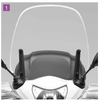
1 High Windshield

Specially engineered for the Vision 50 this polycarbonate Windshield offers perfect shelter from the elements without hindering visibility. Dimensions: 420 × 447 × 2mm.