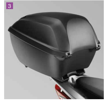
35L Top Box

Set of two clear polycarbonate Knuckle Protectors that attach to the fairing and further improve wind protection without hindering visibility.