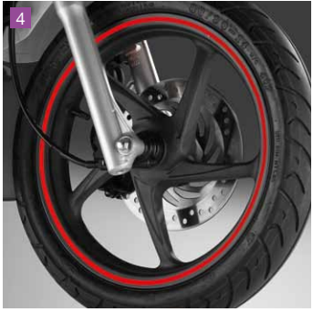
4 Wheel Sticker Set

A Mat Cynos Grey Top Box offering 35L of carrying capacity which can store one full-face helmet and more. Quicklocking and easily detachable in comes with Top Box Carrier to mount to the rear grab rail.