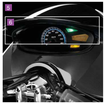
Meter Panel Kit Meter Panel Cover Kit Carbon-fibre effect panel kits to replace the upper and lower parts of the standard meter panel for a stylish, sporty look.