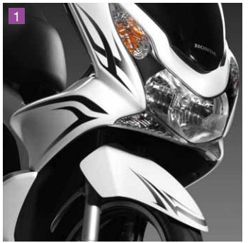
1 Stripe Kit (Full Set) This black fading to grey stripe set is applied to the sides and front mudguard to give a sporty look.