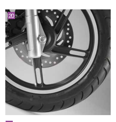
20 Wheel Sticker Kit Silver round shaped stickers applied to the front and rear wheels.