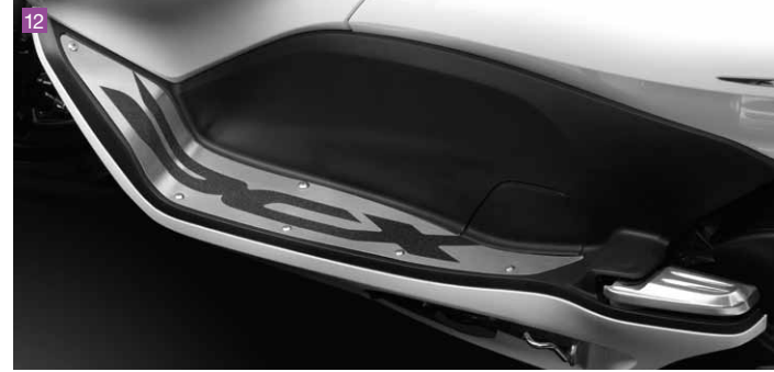
12 Stainless Steel Floor Panel Kit A set of left and right stain

Complete the carbon-fibre look by replacing the standard centre cover and fuel cap with these carbon-fibre effect kits.