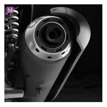
Silver Exhaust End Cover A silver anodised aluminium tip contrasts with the black painted exhaust for a more premium look.

Silver Exhaust Garnish Kit An silver anodised aluminium Exhaust Garnish featuring the PCX logo to replace the standard one to give a more premium look.