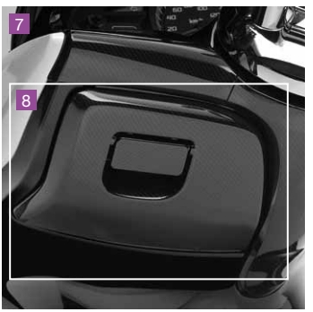
Inner Cover Kit Left Pocket Inner Lid Replace the standard inner cover and left-hand pocket of your PCX with these glossy carbon-fibre effect kits.