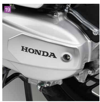
Silver Transmission Cover Garnish This silver anodised aluminium Transmission Cover adds the finishing touch to the PCX.

A silver anodised aluminium Airbox Garnish which is easily applied over the standard version to give a more premium look.