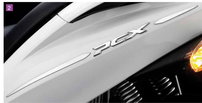
2 Body Garnish Kit Rear left and right garnish will add a touch of elegance to your scooter.