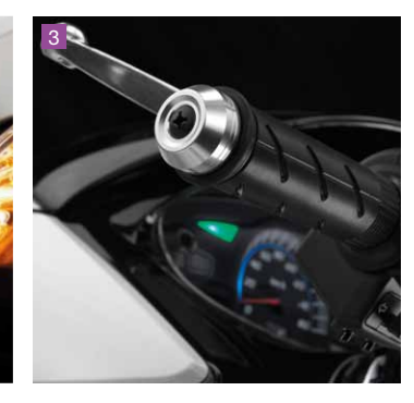
3 Silver Bar End Kit Aluminium silver bar ends to give a more premium look.