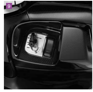
Right Pocket Inner Lid Matching the Inner Cover Kit, this carbon-fibre effect Right-hand Pocket Inner Lid replaces the standard one and adds individual style to your PCX.