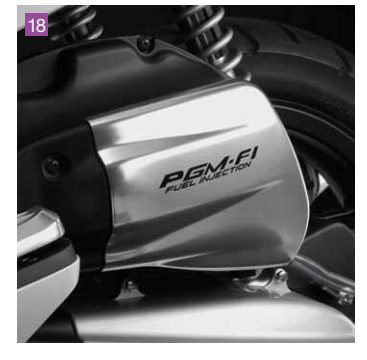
18 Silver Airbox Cover Garnish

A water-resistant and breathable cover that allows the scooter to dry whilst covered, and protects the paintwork from UV rays. Supplied with an anti-flutter rope and two U-Lock holes. It can be used when a Top Box is fitted.