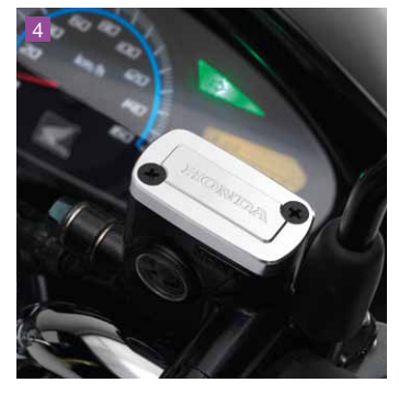
4 Silver Master Cylinder Cap This silver anodised aluminium version replaces the standard one for a more premium look.